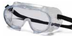
IM045 / 7321

Stock No.: 7320 Comp No.: IM045.....$5.76 /ea.