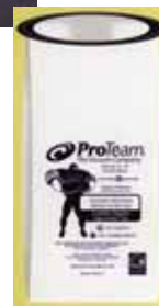
PR020 / PR025