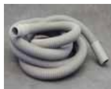
CS041 / PB045

All Nobles Power Eagles offer optional attachments and accessories for cleaning upholstery, stairs and hard to reach carpeted places. Every Nobles machine is furnished with the proper accessories for maximum performance, safety and dependability. Optional accessories are also available to meet special needs. Hand tools are durable cast aluminum. Solution and vacuum hoses are 15 feet and all vacuum hoses are crush-proof and chemical-resistant. These quality accessories are constructed for long life, comfort and economy.