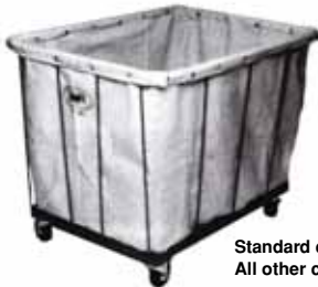
Standard color: Yellow All other colors are $10 each

Our laundry hamper trucks save you valuable space and dollars. The modular knock down design allows for UPS shipping to help save you on your initial cost (see prices below). Frame is a strong and rust resistant powder coated metal. Casters are top quality and extremely durable. Bags are made of heavy duty Glosstex in a variety of colors or white canvas and are ideal for clean and dirty linen collection. Colors available: red, blue, green, yellow, grey or white (please specify bag color desired when ordering). Please allow 2 to 3 weeks for delivery of this special order item.