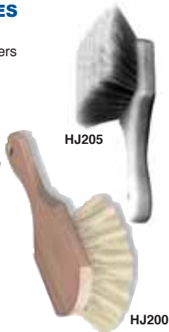
HJ205 HJ200 HJ190

Handle: polypropylene • Length: 8" • Bristles: nylon Stock No.: 620 • Comp No.: HJ190.....$7.25 /ea.